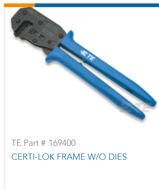
TE Part # 169400 CERTI-LOK FRAME W/O DIES