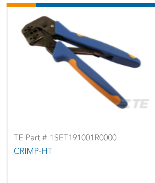
TE Part # 1SET191001R0000 CRIMP-HT