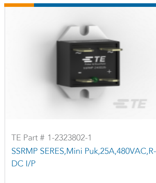
TE Part # 1-2323802-1 SSRMP SERES, Mini Puk, 25A, 480VAC, R-DC I/P