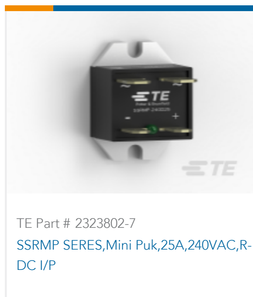
TE Part # 2323802-7 SSRMP SERES, Mini Puk, 25A, 240VAC, R-DC I/P